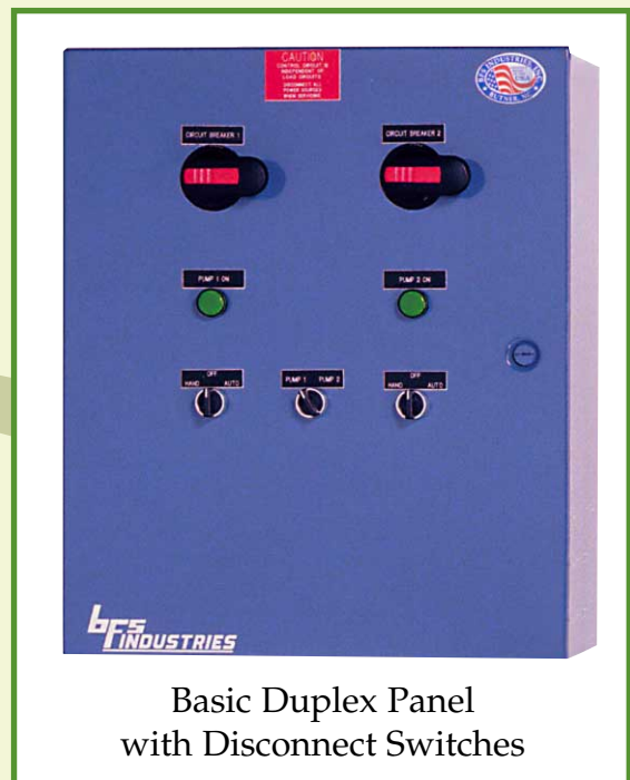
Basic Duplex Panel with Disconnect Switches