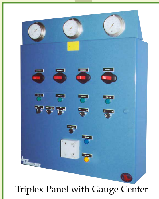
Triplex Panel with Gauge Center