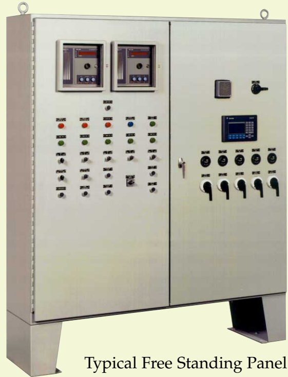
Typical Free Standing Panel