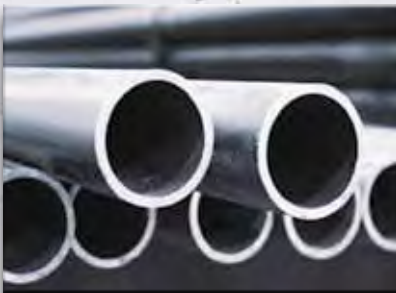
All tubes have a minimum tube wall thickness that far exceeds ASME requirements.