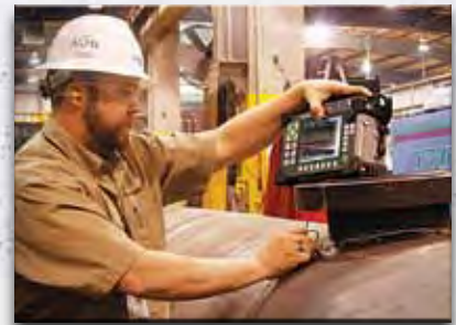
Excellence is a top priority; over 100 checkpoints are in place for quality control, tracked and managed by ITP (Inspection Test Plan).