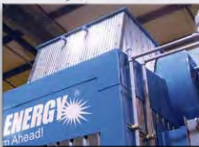
Gas outlets are insulated with 8-lb. high density wool for improved efficiencies and safety.

FUELS: NATURAL GAS, BIO GAS, OFF-GASSES OR #2 - #6 OIL