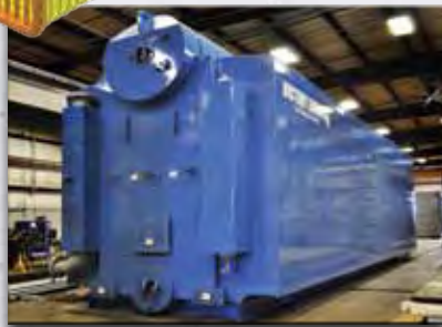
Superheaters are available with a variety of configurations to suit operational requirements of all applications requiring high-temperature steam.