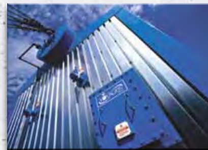
Over-size entryway doors allow easy access.