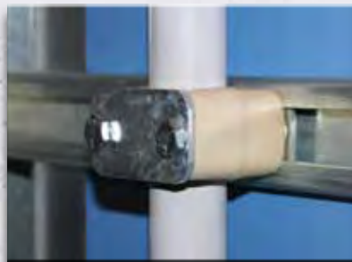
Top-of-the-line dampening pipe clamps are designed to reduce vibration.