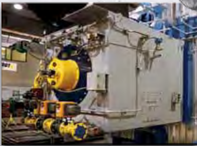
All fired boilers come with low NO x burners that are state-of-the-art and fuel-efficient.