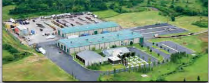
State-of-the-art manufacturing facilities are located just North of Tulsa, Okla.