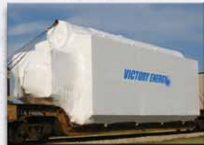
All units are shrink-wrapped for protection during the transport process.