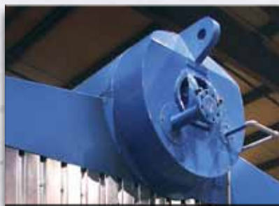
Drum heads are assembled with ceramic insulation covered with carbon steel.