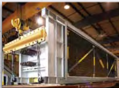
HRSG modules are designed for ease of lifting and movement.