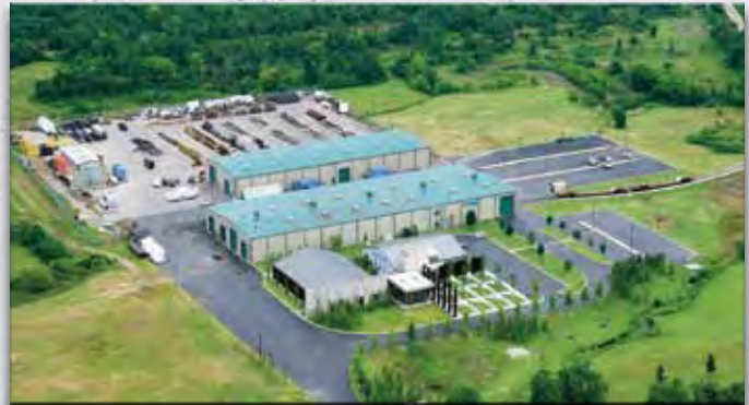
State-of-the-art manufacturing facilities and corporate offices are located just North of Tulsa, Oklahoma.

Victory Energy offers a full range of custom-designed HRSG systems that are designed to deliver proven performance and crucial efficiencies at a cost effective price.