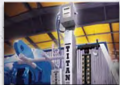
Fully integrated TITAN® water level equipment.