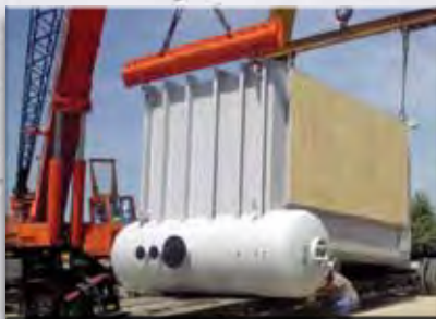
HRSG watertube heat recovery boilers are engineered with patented technologies.