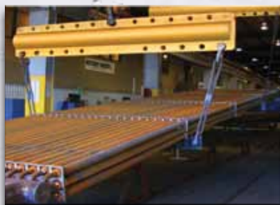
Modular HRSG tube bundle being prepared for internal inspection.