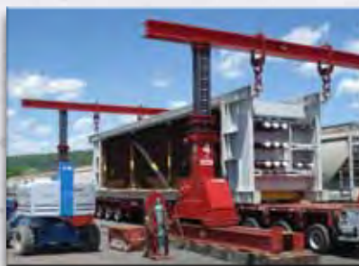
Proper equipment maximizes efficient and save delivery.