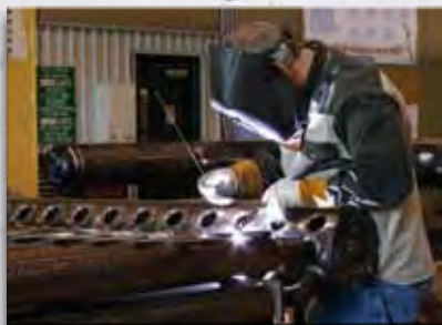
VE has ASME and NBIC Certificates of Authority to design, construct and repair pressure vessels.