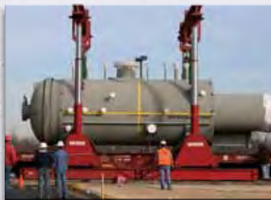
Victory Energy specializes in large-scale fabrication of boilers and pressure vessels.