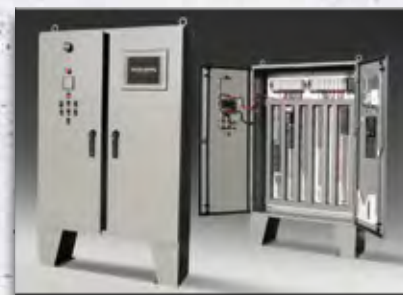
Fully customized control systems utilizing the latest PLC technology.