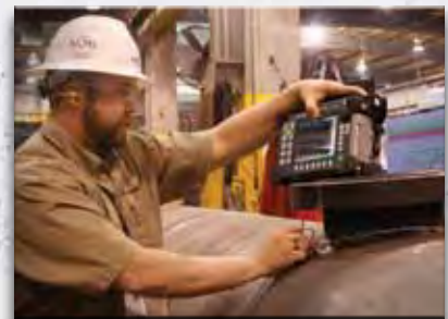
All work is managed by Victory Energy's ITP (Inspection Test Plan) to assure quality control.