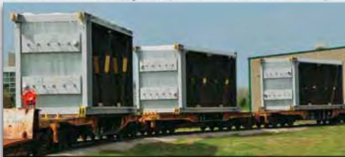
Three of six HRSG modules designed to ship by rail.

Quality materials and superior construction is essential to producing heat recovery systems that are, by design, engineered to be the most reliable steam generators in the world. Our approach to modularization is designed to maximize shop assembly while minimizing costly field labor and delivery time.