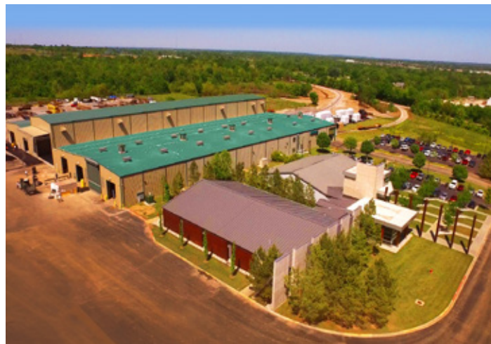
State-of-the-art manufacturing facilities are located just North of Tulsa, Okla.

Quality materials and superior construction are essential to producing industrial-duty boiler systems that are, by design, engineered to be the most reliable boilers in the world. Our approach to modularization is designed to maximize shop assembly while minimizing costly field labor and delivery time.