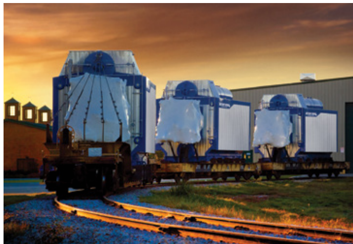
On-site Railway capabilities for over-sized projects.