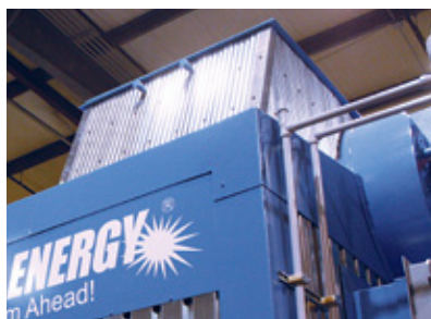
Gas outlets are insulated with 8-lb. high density wool for improved efficiencies and safety.