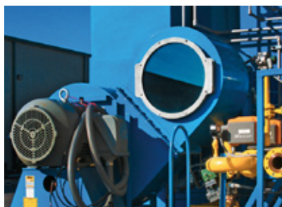
All fired boilers come with low NO x burners that are state-of-the-art and fuel-efficient.

FUELS: NATURAL GAS, BIO GAS, OFF-GASSES OR #2 - #6 OIL