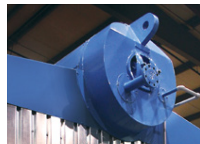
Drum heads are assembled with ceramic insulation covered with carbon steel.