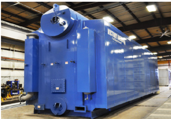
Superheaters are available with a variety of configuration.