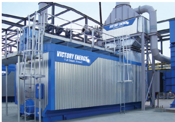
VOYAGER® O-type boiler with EXPLORER® economizer installed.