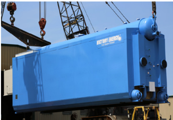
Custom-engineered VOYAGER® A-type boiler.

ABMA American Boiler Manufacturers Association