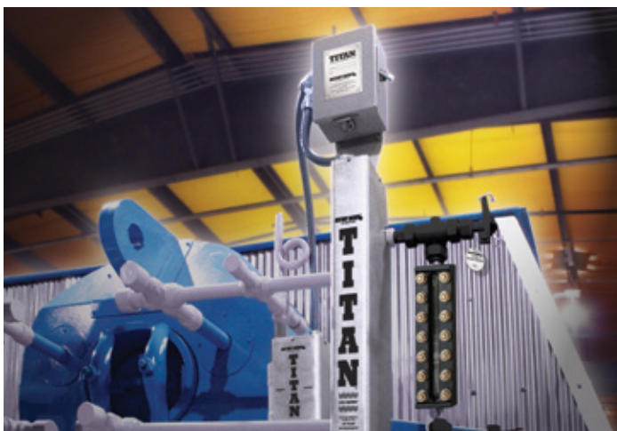
Fully integrated TITAN® water level equipment.