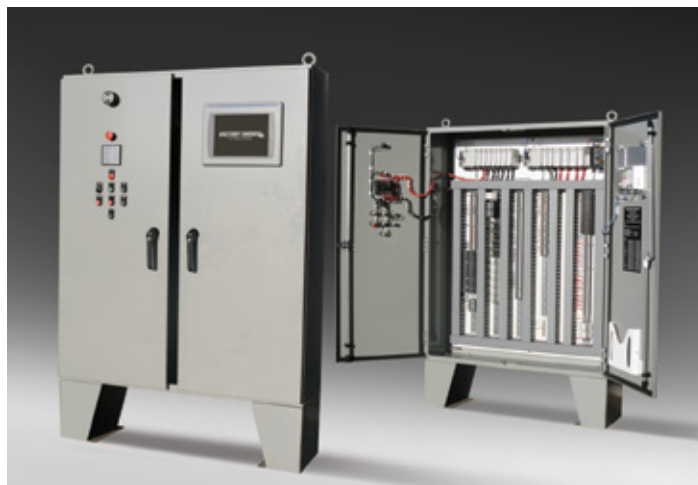
Fully customized control systems, utilizing the latest PLC technology.