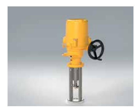
PNEUMATIC ACTUATOR D2