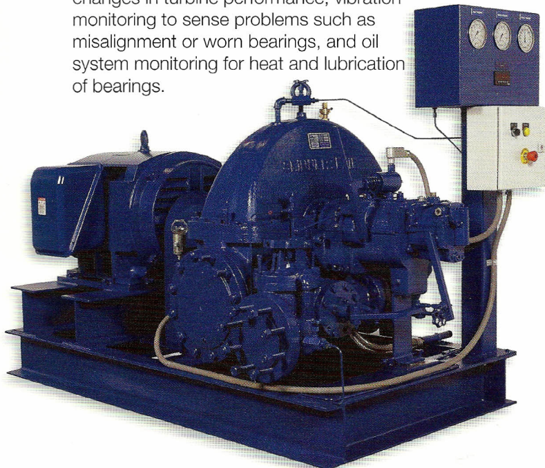
Skinner direct coupled induction steam turbine generator package. (The Skinner synchronous gear package is shown on the front cover.)